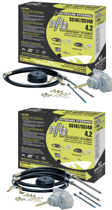
NFB™ 4.2 Single Cable System (Steering Wheel not included.)